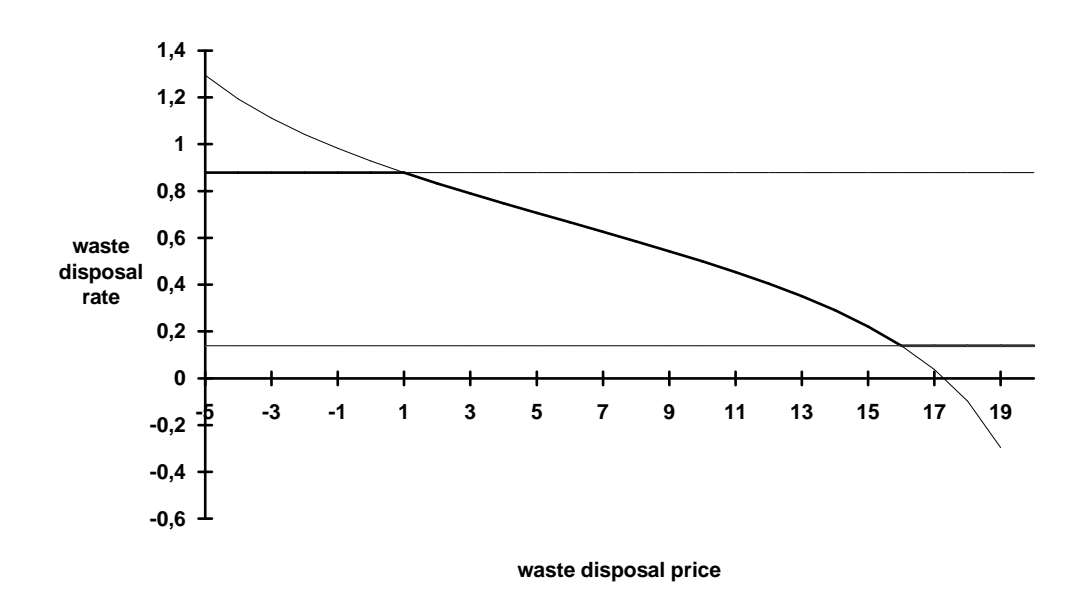
Fig. 3: Optimal waste disposal rate as a function of the waste disposal price

The expression (7) and the figure make clear that the optimal waste disposal rate is a convexconcave function of the waste disposal price. Then price changes influence the disposal rate quite differently: For small and for large price inputs the rate is more sensitive to the price variation than in the case of moderate price inputs. If the cost inputs are very small or very large, then there is no sensitivity at all, because the disposal rate forced by e lies outside the feasibility region.