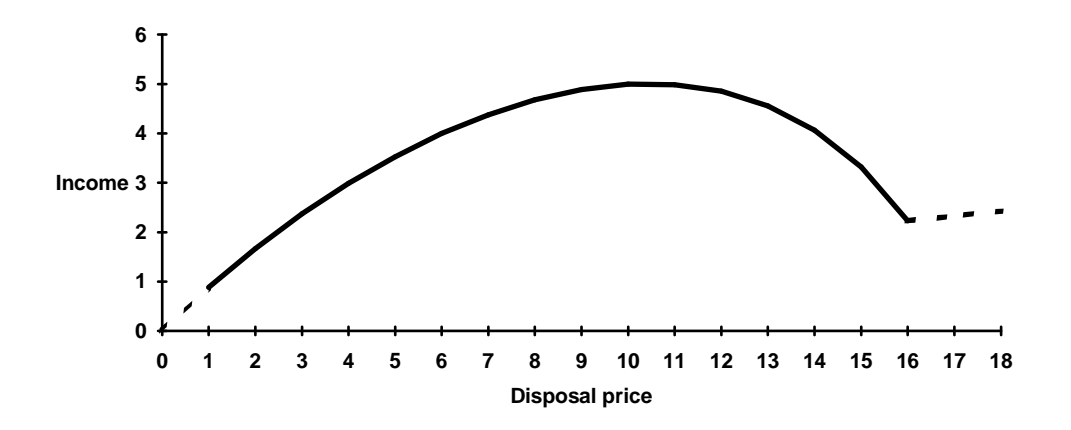
Fig. 4: Income as a function of the waste disposal price for the feasible price region [1, 16]; the behaviour of f(e) outside this region is indicated by a dotted line.

For the above example this function is shown in Fig. 4.