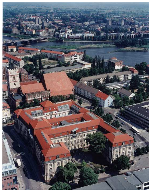
Frankfurt (Oder), Viadrina Main Building, St. Mary's Church, Bridge across the Oder River to Slubice/Poland, Town of Slubice.