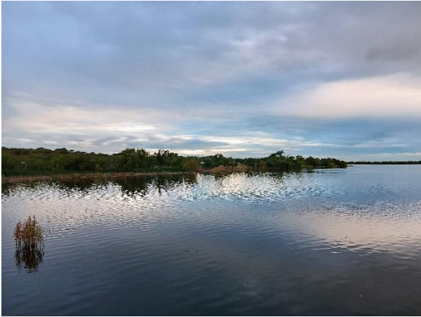
Lake Casa Blanca in Laredo

And to round things off, here are a few pictures from the past few months: