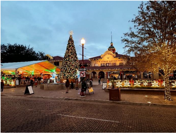
Fort Worth Stockyards