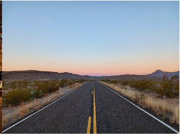
Big Bend National Park