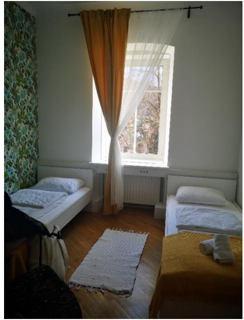
That's the hotel.

The worst that happened was that I had 88% of the subject, and I had to re-take to exam because it was noted as 5,0. There is an exam that is only 10%, and you need 5% to pass the course. Although I did a lot for the course, and I have problems with multiple-choice questions, I was struggling with achieving 20 points from 40. It was not possible to get the course done without this small part. During the stay, I also traveled with my friend by Flixbus. We have been to Swiss, Bosnia-Hercegovina, and Serbia. It was safe and not expensive. To Swiss, we took a bus at night, we have spent the whole day in the city, and we took the bus back during the night! That's a good idea to avoid expensive accommodation. In the end, it was also possible to go camping in Pula in Croatia! Very beautiful seaside, with a cave to swim in. Don't forget to have some money with you because while traveling to those countries, there are different currencies, and sometimes cash is really necessary there. I do not have any bad memories of Ljubljana. It was very sad to leave this city in the end.