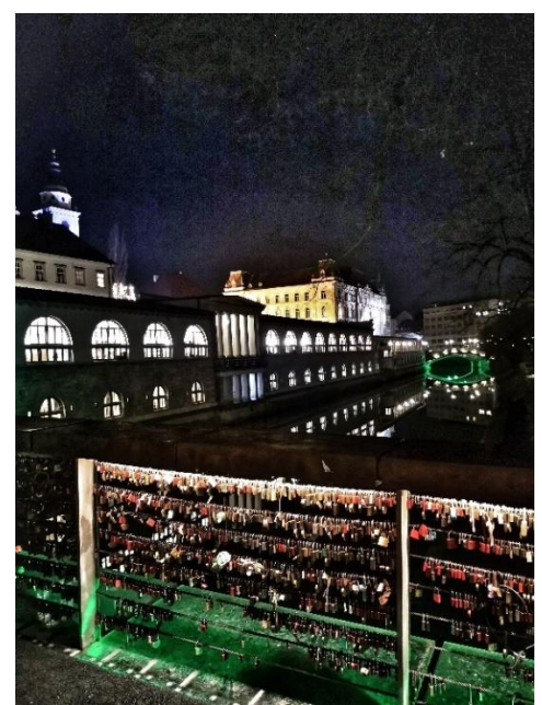
Ljubljana river at night.

The rest I leave for you to discover by yourself! You shouldn't see everything before going there!