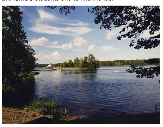
Abb. 2: Trakai - a city close to Vilnius

Before the semester starts, an introduction week offers all needed preparation for the semester. I would recommend attending this week, not only because of all the useful information you'll get, but especially because of the social contacts you'll have after just one day. Most events during these days are held by the international office and its team, but also by the local ESN team. The ESN team has often local students as members who organize different international events throughout the semester. Trips to other cities, sportive activities, international nights and more are perfect opportunities to get to know other ERASMUS students and to find friends.