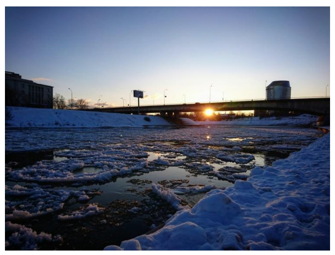
Abb. 1: The river Neris

Before going to Lithuania, you have to be aware of a few things. Visiting the country in winter can be more than challenging. Temperatures can reach lows of -20°C. A good winter jacket and some warm shoes are necessary. Summer and spring can be warm and temperatures might reach 30°C. In any season, a strong wind might change the weather fast and lower degrees feel even colder. Often, spring and fall are more than just wet. Pouring rain can last for days - an umbrella and rain jacket should be part of your luggage.