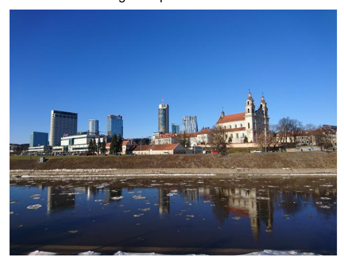
Studies - A normal day at university

The easiest way to stay in Vilnius is having a room in the dorm. Unfortunately, the Lithuanian dorms are far from German standards. Generally, rooms are shared by 2 or 3 people. The facilities are in bad conditions, rooms are narrow and kitchens are dirty. Biggest advantage: a dorm room costs between 40 and 80 € per month. You sleep like a stone, you don't need much privacy and space and you like adventures? Take a dorm room! But if you need your quiet time and you usually study and eat at home, I would recommend looking for a private accommodation.