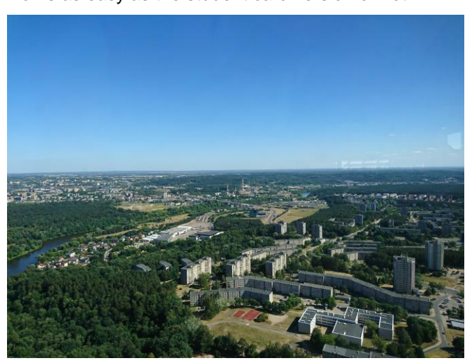
Abb. 3: Vilnius from the top (TV Tower)

your 30 days will start. Once activated, you won't need to do anything with this ticket until it expires and you have to put a new one on your card. Three-month tickets are available as well. The app trafi shows you all busses, routes, times and even has the option to let you add a bus ticket on your phone as well, although I haven't used this option and I can't say, whether it works as easy as the student card version or not.