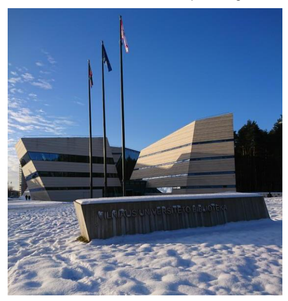
Abb. 4: The library at Sauletekis

Now, after you've reached the university, using whatever kind of transportation, you'll either find yourself within the old town or, and most often, a little outside the city. The campus at Sauletekis (20 minutes from downtown) is also the home of most of the dorms (another advantage of a dorm room). An amazing new library invites students to stay there 24/7. Meals and coffee are provided, backpacks can be taken inside. The Faculty of Economics and the Business School have own canteens, the food is simple but good.